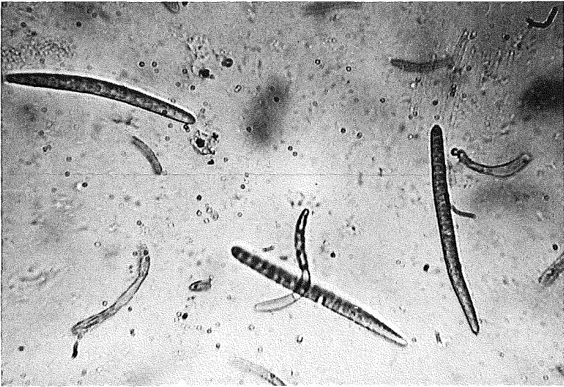
Fig. 3. Ascospores from Geoglossum starbaeckii (AMNH 8176).