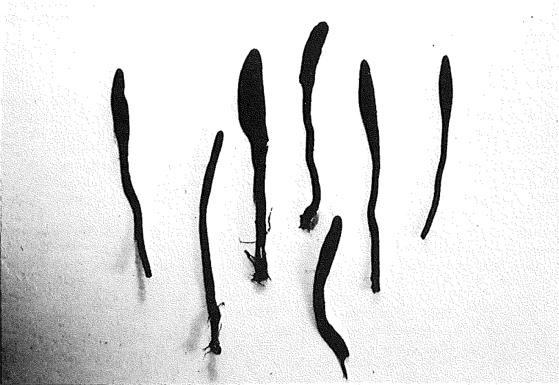
Fig. 2. Geoglossum starbaeckii (AMNH 8176) from Víkurbakki, Byfajörður.